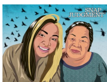
Snap Judgment: Don't Worry, Be Happy