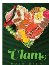
Ulam: Main Dish