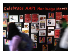
The story behind Asian Pacific American Heritage, and why it's celebrated in May