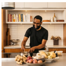
Karachi Cowboys - Seattle Pakistani Soul Fusion Pop Up