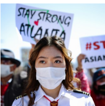
Here's How Music Companies Are Honoring Asian American and Pacific Islander Heritage Month