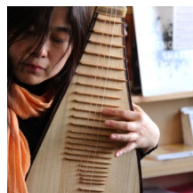
Tiny Desk Playlist: Celebrating Women Across The Globe