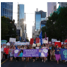
Why Women's History Month is in March