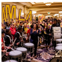
Kamala Harris Makes (Her)story as First Woman and Woman of Color as Vice President