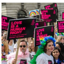
10 Educational LGBTQIA Latinx TikToks You Need to Watch